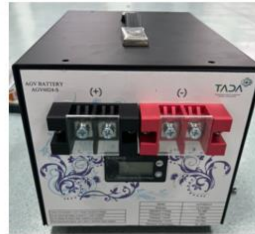
AGV & AMR BATTERY