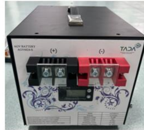
AGV & AMR BATTERY