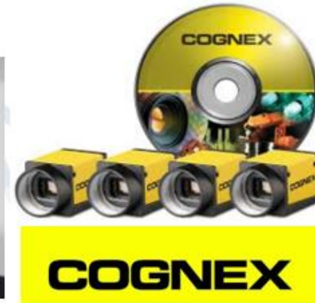
AI & MACHINE VISION