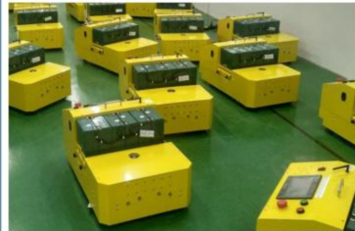
AUTOMATED GUIDED VEHICLE (AGV)