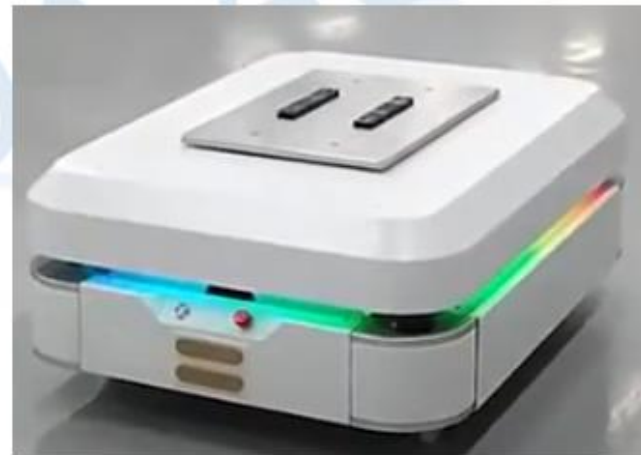
AUTONOMOUS MOBILE ROBOT (AMR)